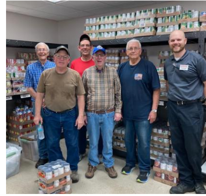
The Knights of Columbus made a generous donation to the Food Pantry.

Join us downstairs after Mass for a breakfast hosted by the NCYC Students.